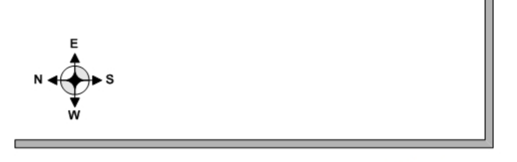
10th Ave Conduit